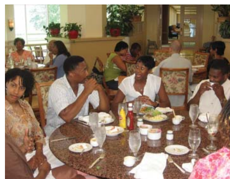
Photos from our marriage retreat featuring sessions, entertainment and fellowship. See more photos on the website.

August 29 & 30 we held our very first marriage retreat for It Takes Three at the beautiful Lansdowne Resort and Conference Center in Leesburg, VA. We started things