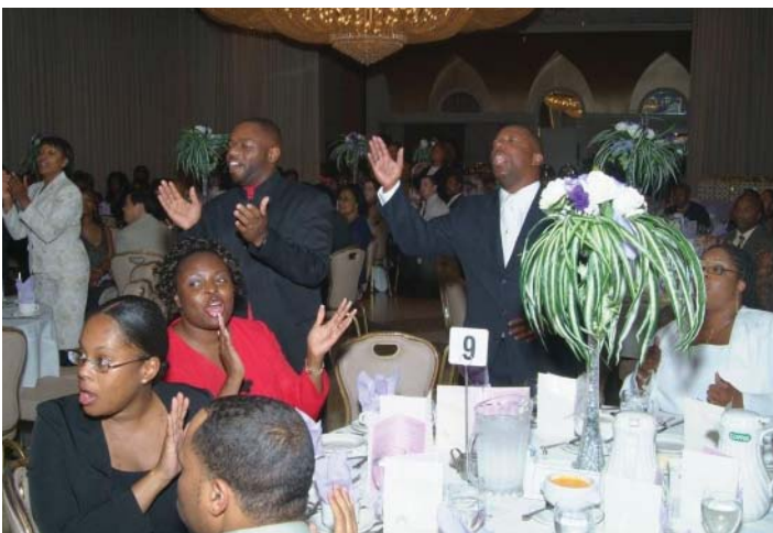
See more gala celebration photos on the website.

On Sunday August 26, 2007 It Takes Three Marriage Ministries held a Gala Celebration to introduce this new marriage ministry. It was held at Martin's Cross-