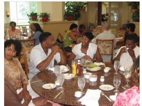
Photos from our marriage retreat featuring sessions, entertainment and fellowship. See more photos on the website.

August 29 & 30 we held our very first marriage retreat for It Takes Three at the beautiful Lansdowne Resort and Conference Center in Leesburg, VA. We started things