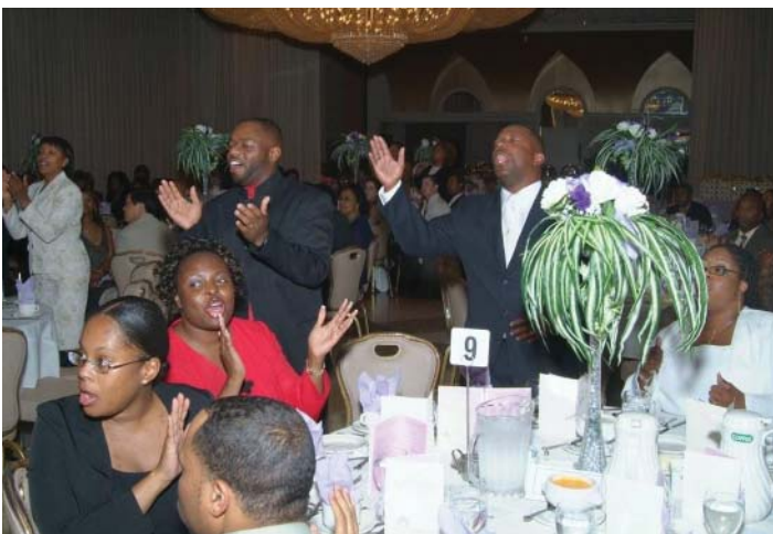
See more gala celebration photos on the website.

On Sunday August 26, 2007 It Takes Three Marriage Ministries held a Gala Celebration to introduce this new marriage ministry. It was held at Martin's Cross-